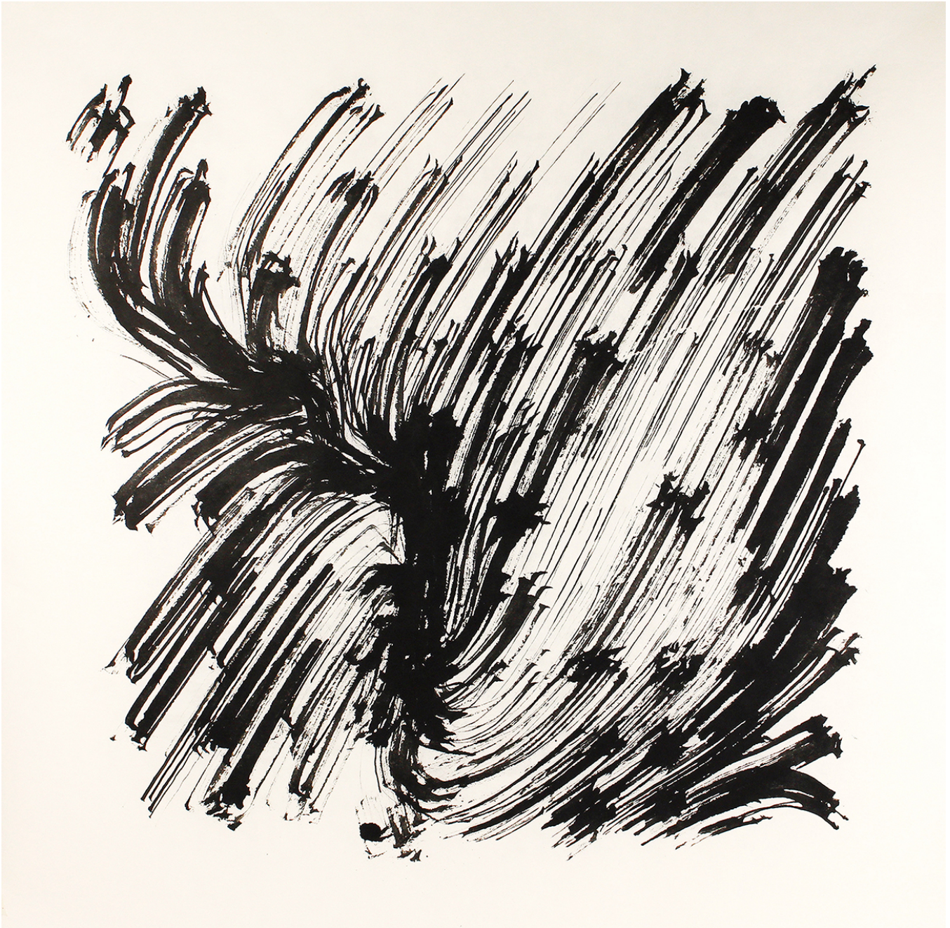
Figure 3: Contingent Dreams

collective agency of the performance. In Contingent Dreams artistic intention is continually refigured through performance mediated by machine, material, medium, sound, and environment. The drawing emerges as audio data is translated into an algorithmic composition, the composition is plotted as series of robotic joint movements, and the robotic brush strokes – with drops, splatters, and streaks of ink from wild brush hairs – create new forms (Fig. 2). Meaning