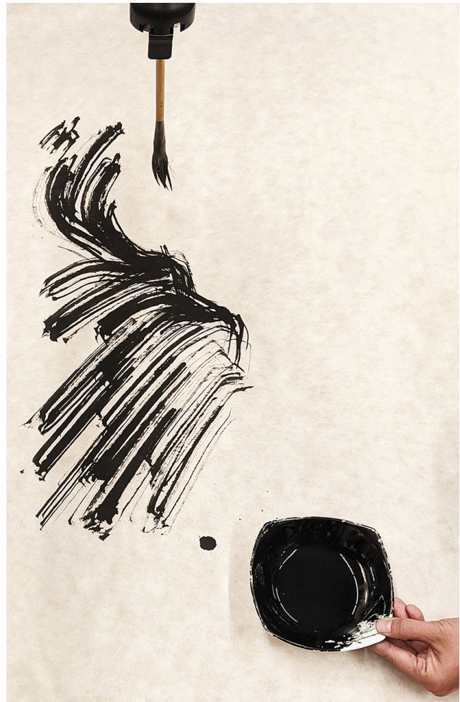
Figure 2: Robotic drawing as performance

In Contingent Dreams , a collaborative robot draws an algorithmic composition derived from audio recordings, rendering the sounds of the city in sumi-e ink. The artist not only programs the algorithm, but also helps the robot, wetting the brush with ink. At first glance, this work may seem rigid and predetermined for the robot follows a prescribed set of rules, executing the design automatically with mechanical precision. The data, the performance, and resulting drawings, however, are dynamic and full of surprises. The audio, recorded while walking the streets of the city, captures the cacophony of everyday life. The drawing medium, ink, is fluid. The